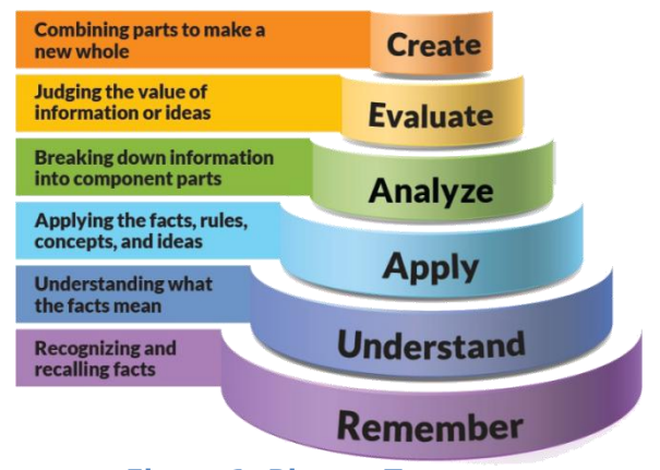
Figure 1: Blooms Taxonomy

(Blooms taxonomy has been given for reference)